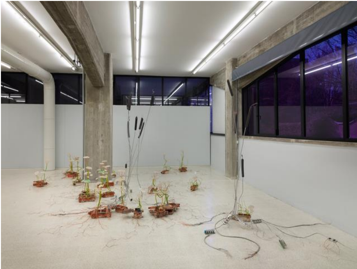
Krištof Kintera, Postnaturalia , 2016, exhibition view at Collezione Maramotti.

Kintera began the project after a visit to the Musei Civici, a fascinating and creepy 19th-century anthropology museum in the historic centre of Reggio Emilia. The museum's dimly lit, labyrinthine Wunderkammer displays are packed with everything from ancient fossils to human genitalia pickled in formaldehyde; the spoils of safari are mounted in a grand entry hall. Inspired by a room of rare, colourfully preserved fungi, Kintera produced his own specimens using materials fished from a local electronic rubbish dump, some of which are temporarily on display in the museum's locked vitrines, with names like Gratia Informatica or Radaria Pulsa that ape Linnaean classification.